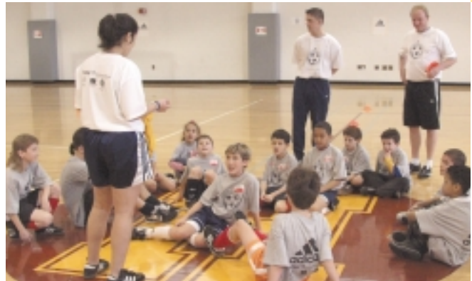
Starfinder at The Haverford School

The holiday camps last six hours per day, with two-thirds of the time spent on soccer instruction and one-third of the time devoted to the "Character Counts" curriculum. As part of the program, children are divided into small groups to discuss issues of importance at school, home and in their community.