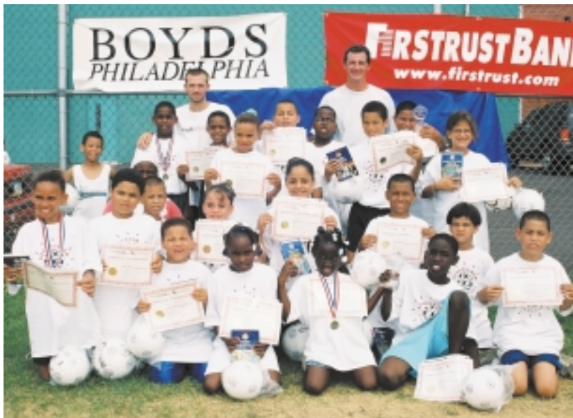
In the summer of 2002, Starfinder held its initial camp for 30 children at the Roberto Clemente School in North Philadelphia.